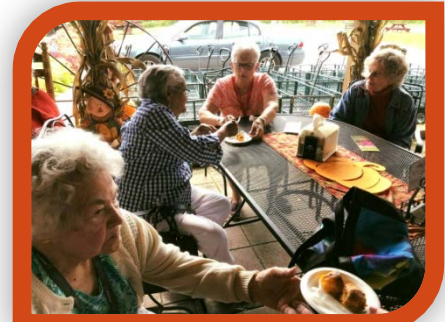
The Clarke County Senior Center took a field trip to a local farmers market. They enjoyed a picnic lunch with lovely weather!