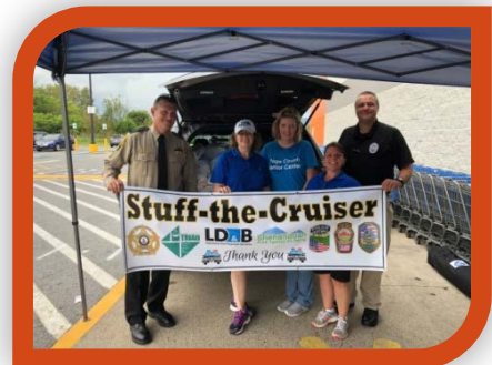
SAAA Partnered with TRIAD in Page County for 'Stuff the Cruiser' with donations for the seniors in the area.