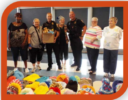
Winchester Senior Center participants donated knitted caps to Winchester PD & Valley Health to pay it forward.