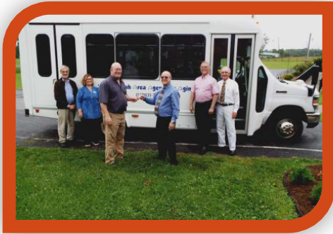
SAAA presented a new grant funded accessible van to Shenandoah County Senior Center.