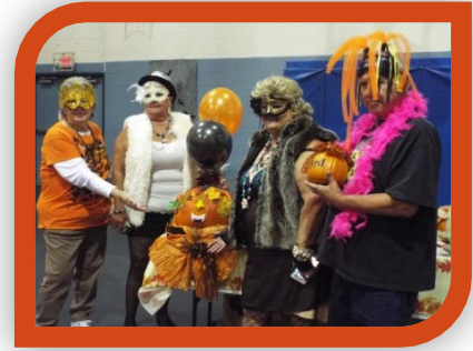
The Senior Centers came together for a Fall Festival with costumes & pumpkin decorating.